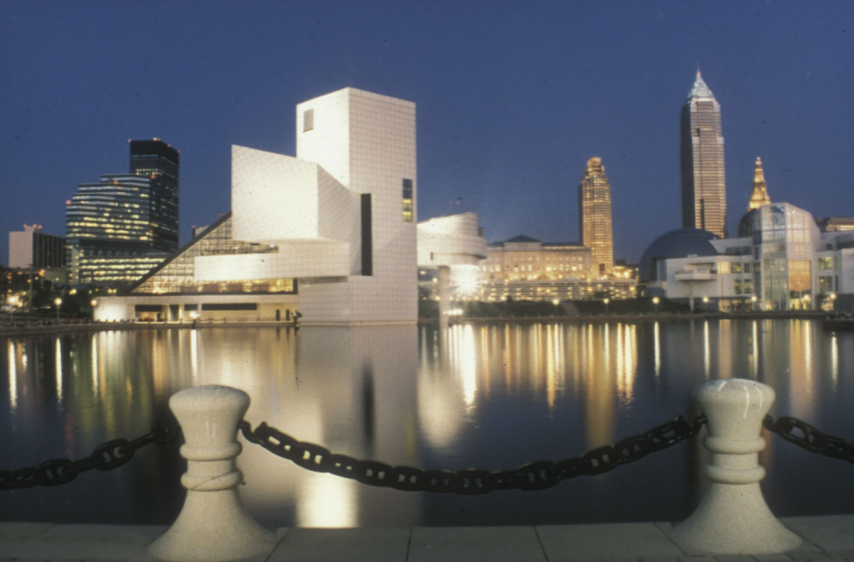
Cleveland's North Coast Harbor and the Rock and Roll Hall of Fame.

Public Square, at the center of downtown Cleveland's business, shopping, theater, and entertainment districts. Opened in 1918 as Hotel Cleveland. the building (now on the National Register of Historic Places) became part of the vast Cleveland Union Terminal railroad station and Terminal Tower office complex, in 1930. Thoroughly renovated in 2002, the Renaissance hotel boasts "exceptional accom-