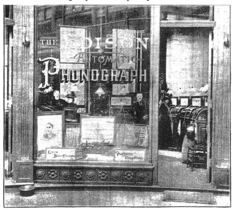
Image courtesy of Patrick Feaster, from The Phonogram, November-December 1891.