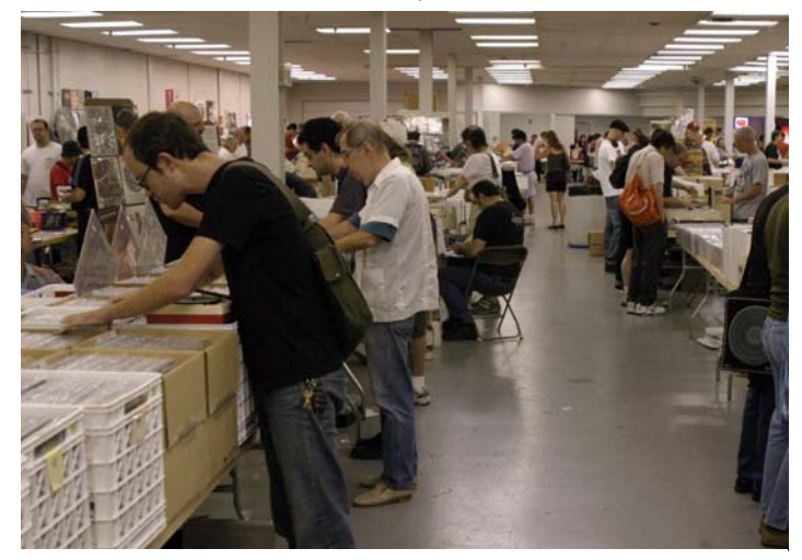
Vinyl fanatics dig through the bins of collectible records at a recent Austin Record Convention, which coincides with the spring ARSC Conference

Finally, it should be noted that the conference hotel overlooks Town Lake and is situated right next to the largest urban bat colony in North America and possibly the world. Populated by over one million Mexican Free-Tailed Bats, the Congress Avenue Bat Colony is in residence from mid-March to early November, and can be