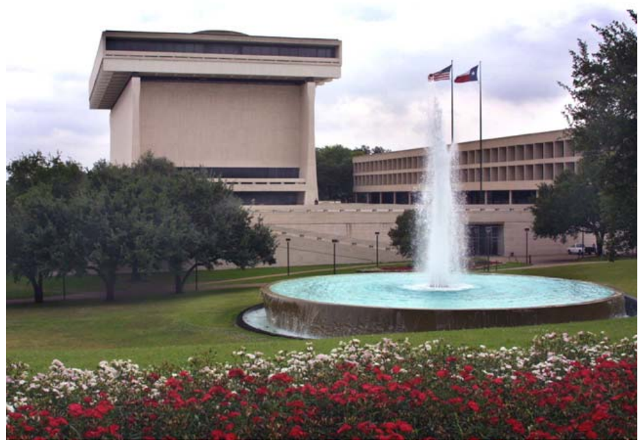
The LBJ Library will be offering tours for ARSC Conference attendees.

As a bonus, conference registrants are likely to find many treasures at the Austin Record Convention. Advertised to be "the largest sale of recorded music in the USA," the convention will take place at the Crockett Event Center, during the weekend of the conference.