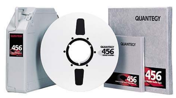
Quantegy, the successor to the Ampex Corporation, produced blank tape such as 456, a staple of the recording industry, and because of sticky-shed syndrome, a troublesome tape for archives.

The plant reopened with a skeletal staff to sell off warehoused stock on Monday, and the following Monday, January 10, Quantegy filed for Chapter 11 protection.