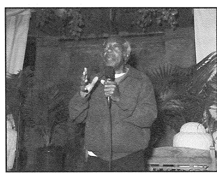
The Magnificent Montague

Straits Cafe offered a unique setting for the closing banquet, where we enjoyed platters of Asian fusion cuisine, served up family style, under a canopy in the Balinese garden. After the presentation of the ARSC