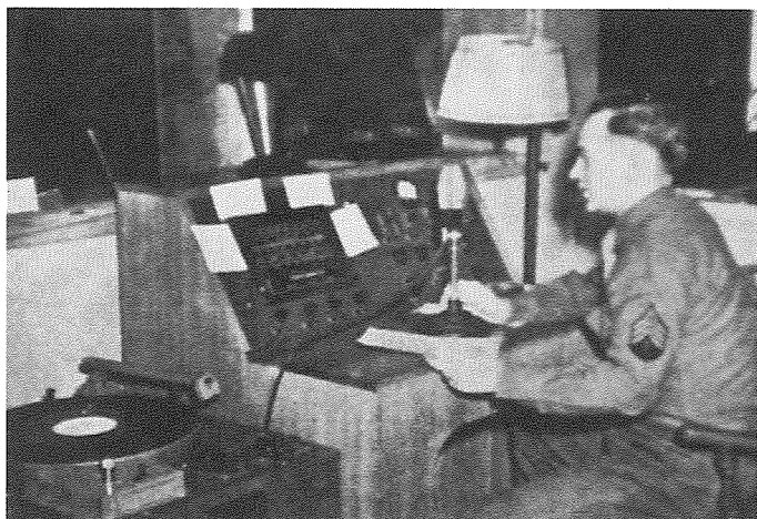
KMGH, Ft. Lewis