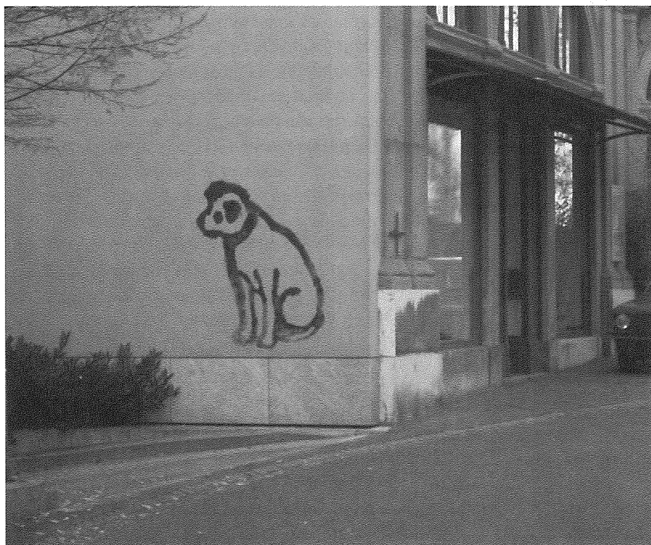
Nipper in Luzern Photograph by Doug Fink, Lucerne, Switzerland 2006