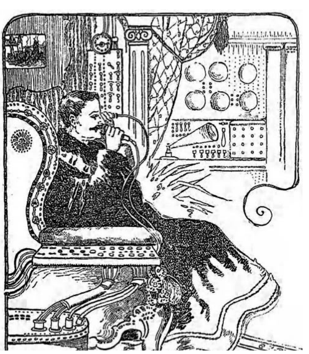
"Glimpses of Christmas as it may be in the year 2000." Brooklyn Daily Eagle, December 22, 1901.

The workshop takes place in Pittsburgh, PA in conjunction with ARSC's annual meeting, and as in recent years will also be offered in a live streaming online version for those who are unable to attend the conference in person. A recording of the live stream will also be made available to all registrants, online and on-site, for a limited time.