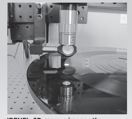
IRENE's 2D camera images the grooves on a lacquer disc.

The IRENE technology was developed by the Lawrence Berkeley National Laboratory in collaboration with the Library of Congress.