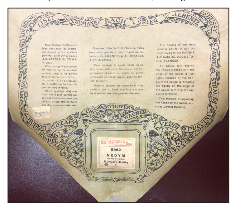
Fig. 2 – Dissemination file for RP 5982P